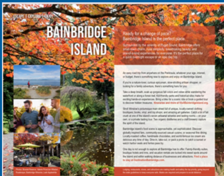
Show the Love Staycation Guide