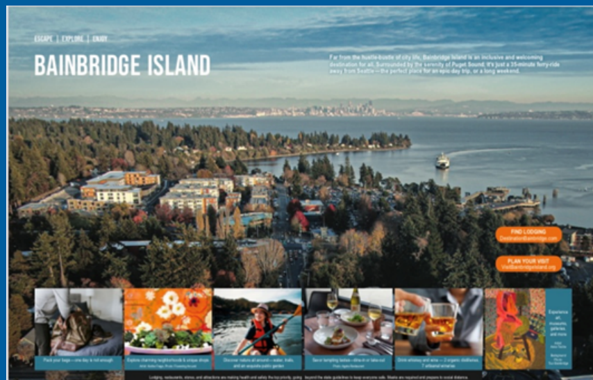
GSBA Perspective Magazine & Pacific Publishing, Annual Seattle Annual Manual